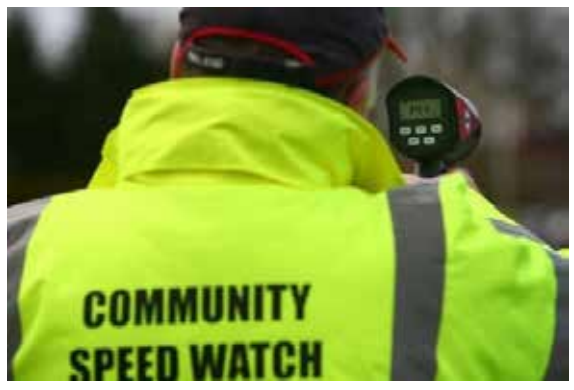
Community Speed Watch Co-ordinator. Chairman Maiden Bradley Parish Council