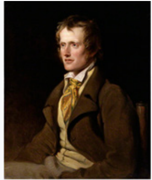
John Clare by William Hilton, oil on canvas, 1820

Is there another world for this frail dust To warm with life and be itself again? Something about me daily speaks there must, And why should instinct nourish hopes in vain? 'Tis nature's prophesy that such will be, And everything seems struggling to explain The close sealed volume of its mystery. Time wandering onward keeps its usual pace As seeming anxious of eternity, To meet that calm and find a resting place. E'en the small violet feels a future power And waits each year renewing blooms to bring, And surely man is no inferior flower To die unworthy of a second spring?