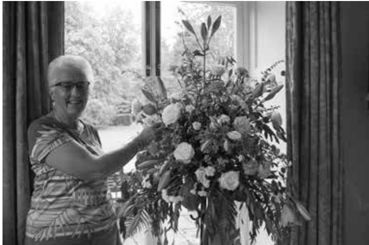
Photos from the 2018 festival at Bradley House